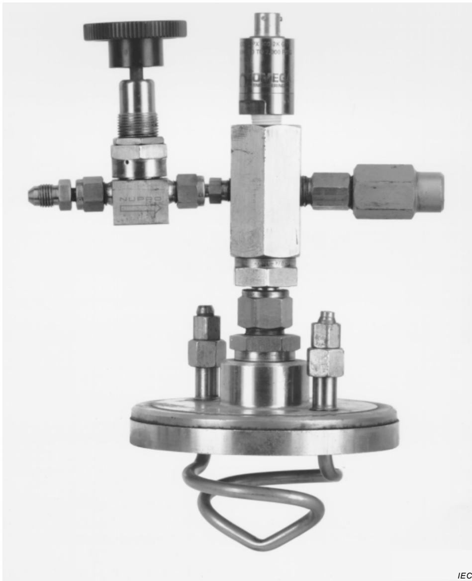
Figure 3 – Condenser coil